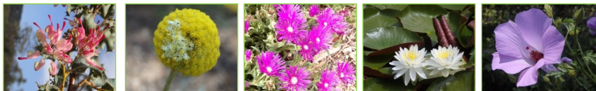
More photos from Horse Island.