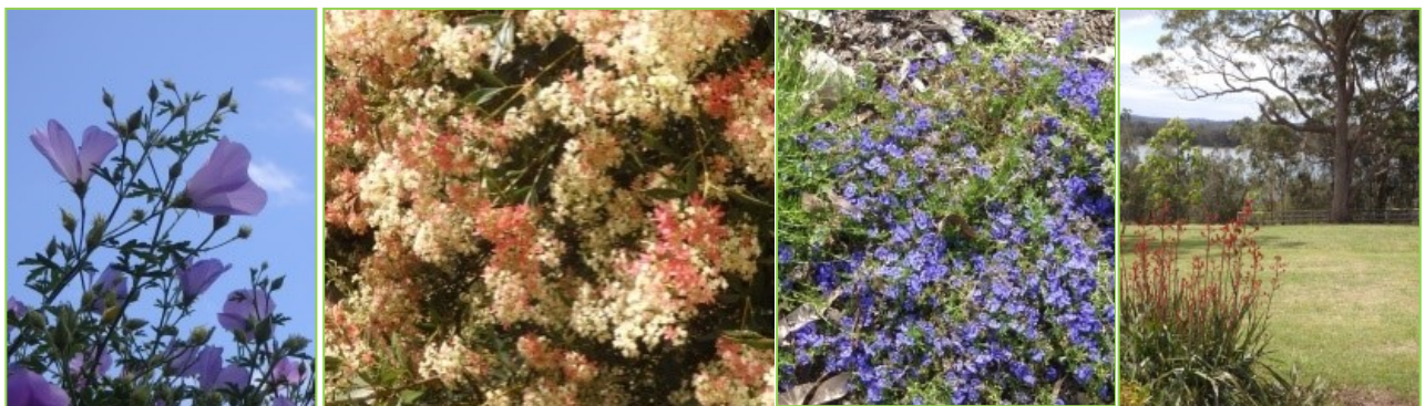
Some photos from Horse Island.

Income at meeting: Plant sales: $36, raffle tickets: $26.60; Total: $62.60