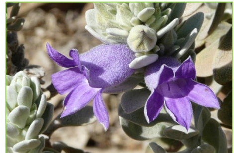
Photo at right of Eremophila mackinlayi subsp. mackinlayi