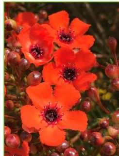
L to R below: Pileanthus rubronitidus , Verticordia plumosa