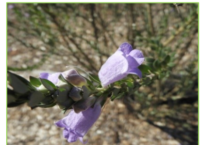
L to R: Eremophila bignoniiflora , Eremophila calorhabdos , Eremophila christopheri

Other arid plants in flower included the colourful Butterfly Bush Petalostylis labicheoides , Regal Birdflower Crotalaria cunninghamii (Photo below L.) and Goldfields Bottlebrush Melaleuca coccinea (Photo below R.).