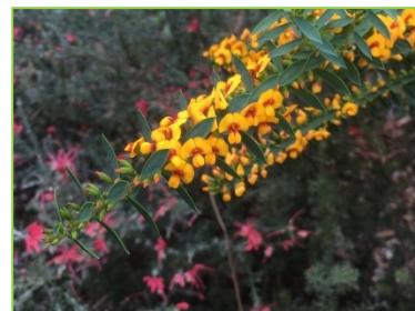
(Photos above taken at Sylvan Grove Native Garden, September 2019 by Jan Douglas.)