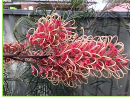
L to R above: Eremophila calorhabdos , Grevillea laurifolia , Grevillea 'Majestic'