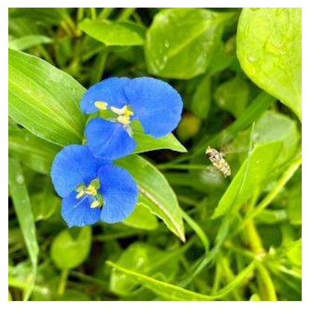
1 Commelina cyanea in flower