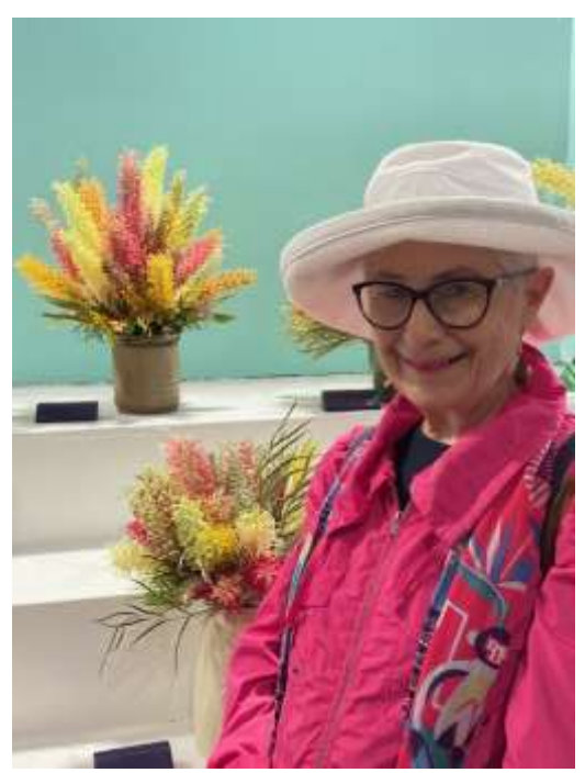
2 First for my Grevillea arrangement