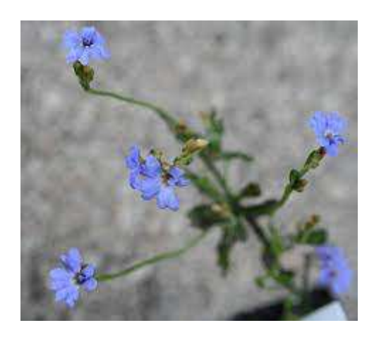
7 Dampiera stricta

https://www.austplants.com.au/Harbour-Georges-River