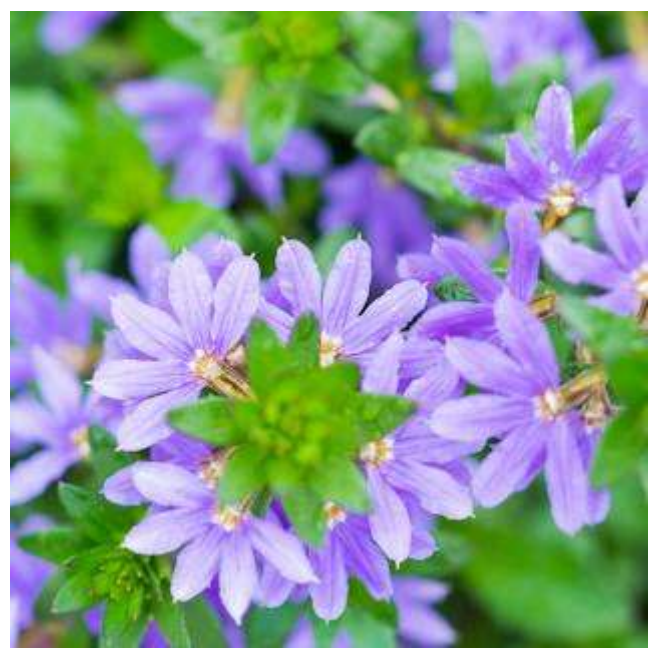
6 Scaevola aemula

I was radicalised by the butter flies And later by a tree. And then a word from a passing bird Put radical thoughts in me. And I am on the watch-list now With the fish and the pixies too, Who call to me with a note of glee "Just do what you can do"