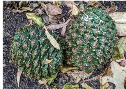
Araucaria bidwillii , Bunya Pine