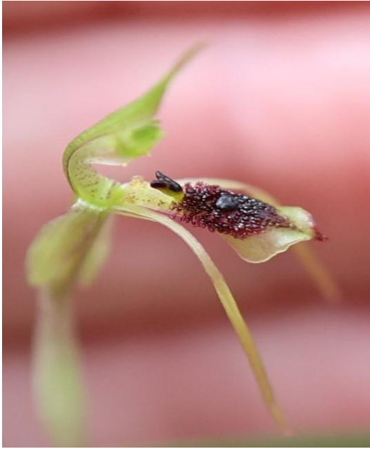
Chiloglottis diphylla - Common Wasp Orchid side shot