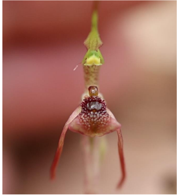
Chiloglottis diphylla - Common Wasp Orchid - front shot