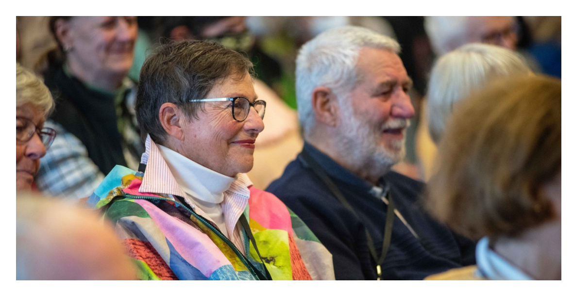
Figure 5: ANPSA conference participants

In association with John Aitken, I am also co-editor of the quarterly journal, Australian Plants . Together we decide on the theme of each issue, liaise with authors and photographers to source and proof content, prepare layouts and organise distribution to other states and subscribers.