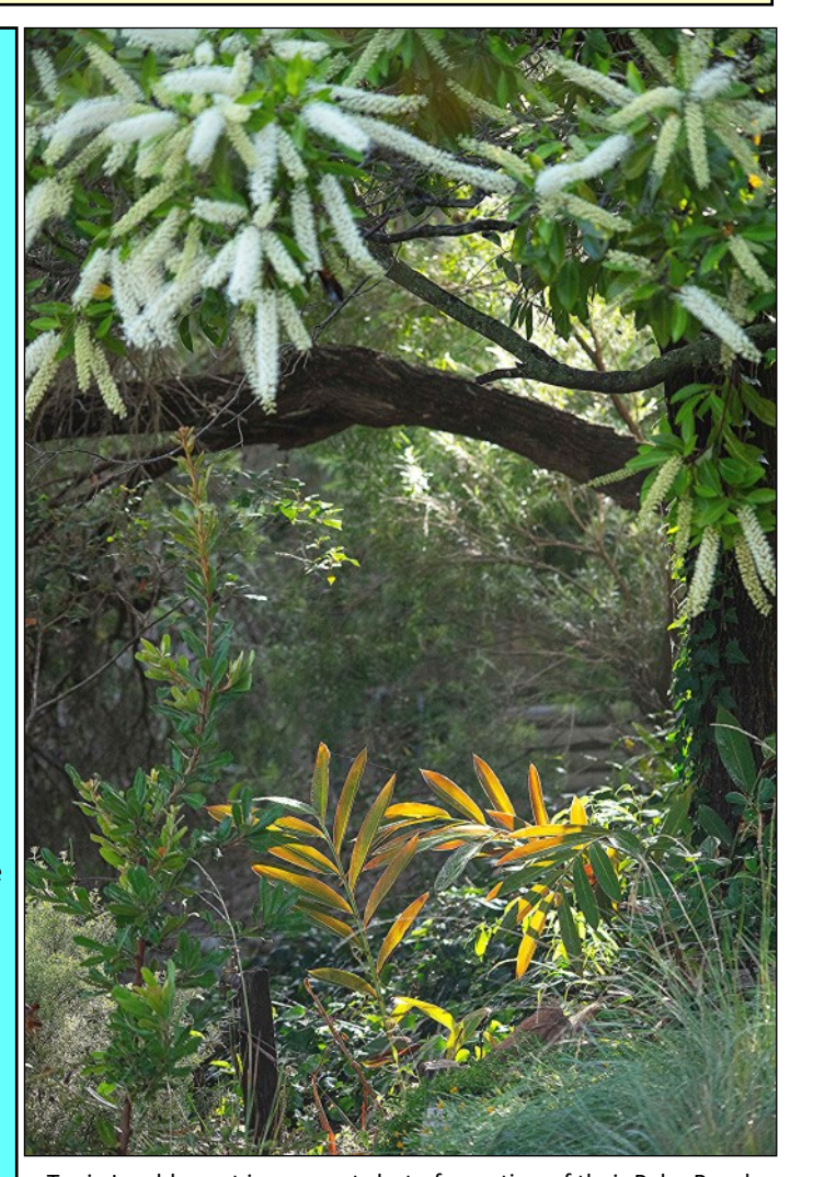
Tania Lamble sent in a recent shot of a section of their Palm Beach garden:

Buckinghamia celsissima (Ivory Curl tree) & Alpinia caerulea 'Red Back' (native ginger hybrid)