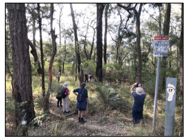
Sue Fredrickson's images