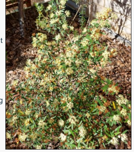
This is one of the many creamy / yellow flowering subspecies being sold as Phebalium squamulosum 'Dusty'