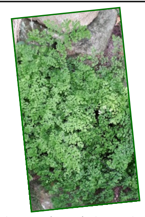
Adiantum, (genus) the maidenhair fern, is a winner outside or inside.