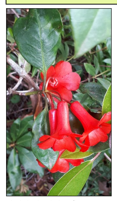
Rhododendron lochiae flowers in Sue Bowen's garden