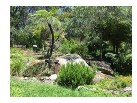
From Caley's Garden,