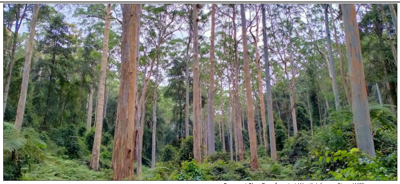
Remnant Blue Gum forest at Westleigh