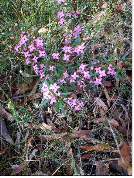
Boronia ledifolia Recently in flower at KWG

Full details of the times of these activities and the people to contact about participating in them occur elsewhere in Blandfordia . (See page 6)