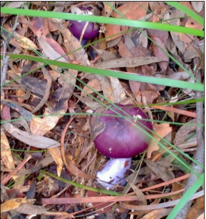
Maybe this fungi was spotted and /or collected by Banks while botanising. This image was taken at Kurnell on 15<sup>th</sup> May.