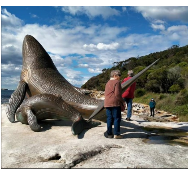
Kamay Botany Bay National Park

*The Endeavour first sighted the east coast of Australia on 19<sup>th</sup> April 1770 (Point Hicks, Victoria). There was one landing at Botany Bay in NSW and thirteen landings were in Queensland (several were on islands). The largest collection of specimens was made near Cooktown where the Endeavour was put ashore for repairs.