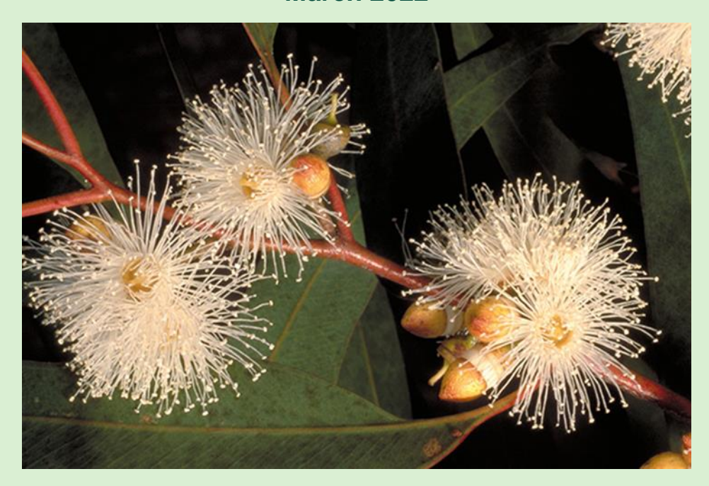
Eucalyptus parramattensis - Calgaroo