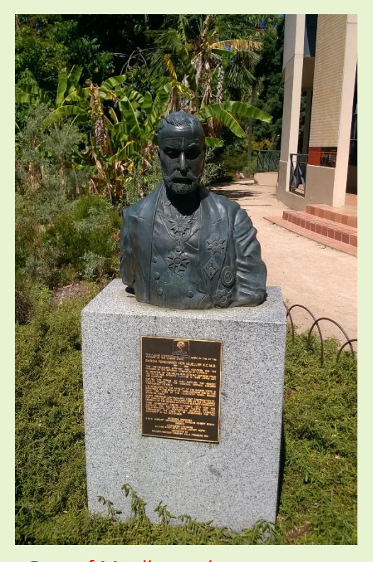
Bust of Mueller at the Royal Botanic Gardens, Melbourne

During his career, von Mueller corresponded prodigiously with individuals all over the world. Through his membership of myriad scientific societies, he became the most important link between Australia and scientific research taking place elsewhere.