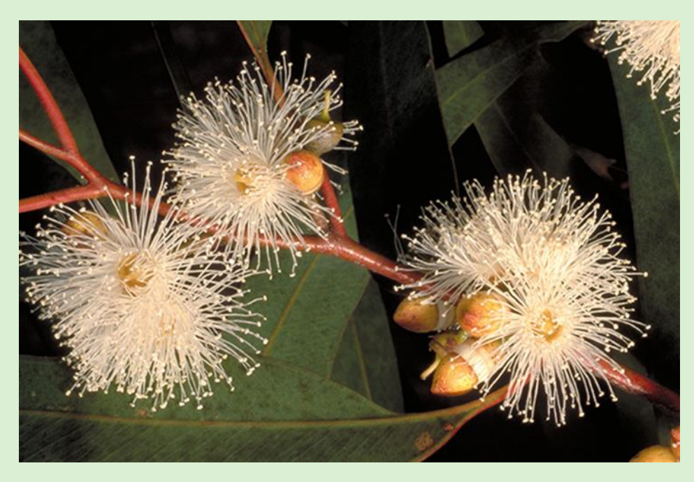
Eucalyptus parramattensis - Calgaroo