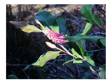
Persoonia mollis caleyae (right) and Grevillea macleayana (below)

We started our walk south, on the Old Coast Road track, with our guide pointing out the rare Grevillea macleayana (above) under mallee forms of Eucalyptus sieberi and Corymbia gummifera ; and the rare Persoonia mollis caleyae in sparse flower; it grows only on Wandrawandian Siltstone, one of the Sydney Basin rocks.