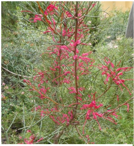
Looking very Grevillea like, Hakea purpurea from NSW and Q'land, is a favourite haunt for smaller birds, safe from attack by wattlebirds

As past leaders of the Australian Garden Design Study Group Ben and Ros show their garden has much to offer visitors by way of aesthetics and plant choice.