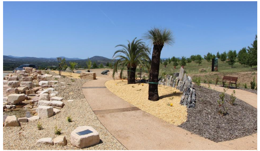
Granite, sandstone and basalt rocks and boulders are used to represent the Australian Landscape.

The oval garden represents the island coastline and the Great Dividing Range sweeps across the continent from north east to south, physically expressed in a subtle landform.