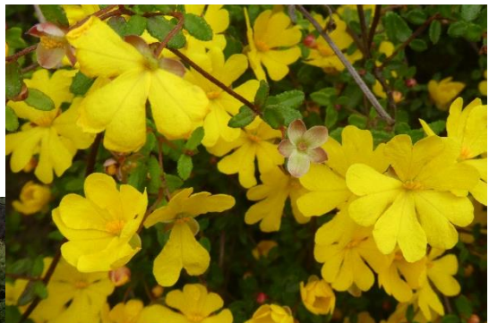
The scrambling climber Hibbertia empetrifolia occurs locally, and would be a worthwhile addition to our gardens. Does anyone grow it anymore?