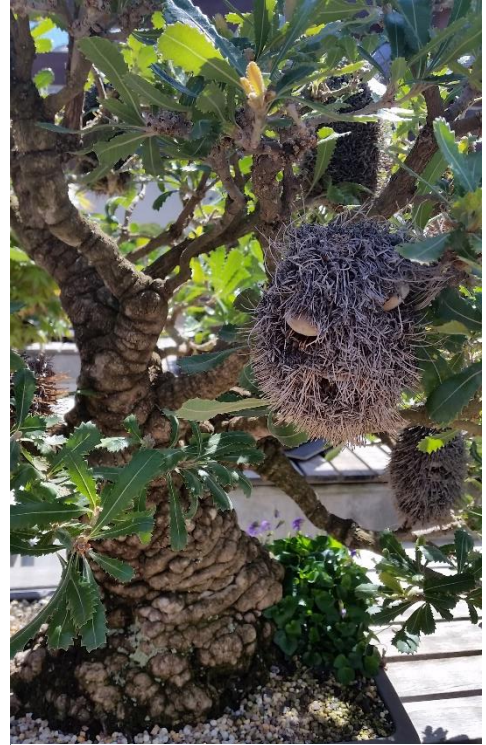
Banksia serrata, looking ancient beyond its years.

Any member wishing to receive a copy of the plant list for species grown at the STEP garden can do so by emailing a request to the editor.