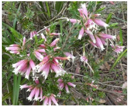
Epacris calvertiana ssp versicolor