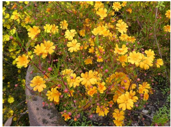
Hibbertia stellaris, a delightful W.A. species now rarely grown

Acacia lineata is a hardy shrub occurring naturally west of the Great Divide. At ANBG the plant is growing in competition with Eucalypts, but manages to put on a spectacular display, and was much admired.