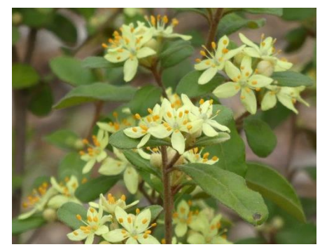
Asterolasia asteriscophora "Lemon Essence"