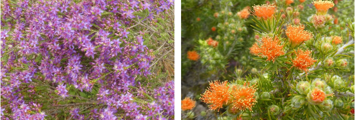
The brilliant colours of Western Australia's heath country, purple Calytix leschenaultii and orange Eremaea acutifolia . Both would make stunning container plants.

Yellow of Pultenaea altissima and white of Clematis aristata make a stunning statement in a shaded garden. Both are local plants we could easily accommodate.