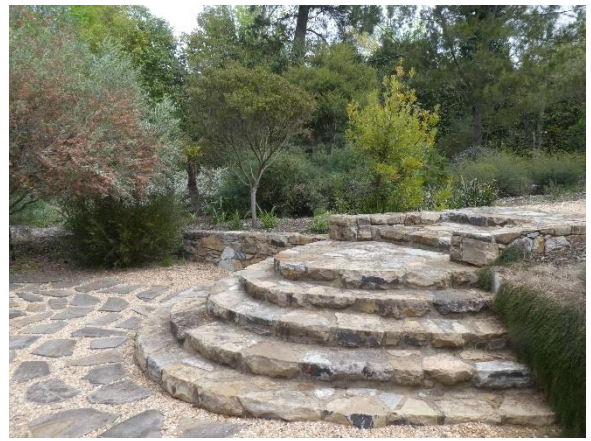
A great change of level, with sympathetic use of local rock

Ben and Ros have learned a great deal about the Red Hill property in the last 16 years. They say their garden is a living, changing artwork. The variety of shapes and textures that the garden presents is very pleasing, but as with all gardens, it is never finished. In general, very few plants have been lost to cold and frost. The majority of plant losses occurred during January and February, not because of the lack of water, but they expect excessive heat. Of course, plants die, or they grow too big (they haven't read the label), or they don't appreciate our conditions, so don't grow well, if at all, so they get moved, or removed.