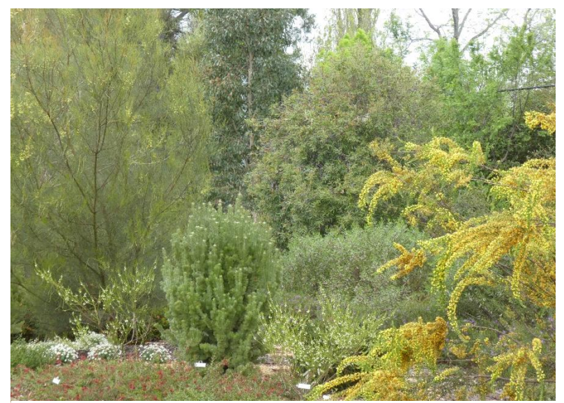
A garden of surprises, full of small bird's chatter

Over a period of 2 years, from 2001 to 2003, in consultation with Helen by email and letter from America, where they lived at the time, a plan was developed for the garden with basic design principles including: