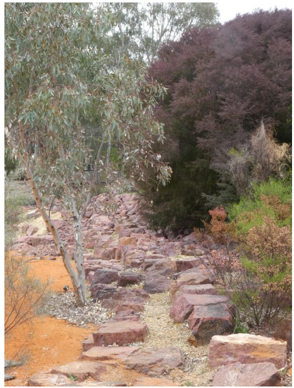
A brilliant interpretation of the red centre escarpment country at ANBG

Yellow of Pultenaea altissima and white of Clematis aristata make a stunning statement in a shaded garden. Both are local plants we could easily accommodate.