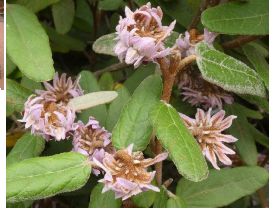
A tough low spreading shrub from coastal southern WA and SA, Lasiopetalum discolor was once a popular garden plant, now rarely grown.