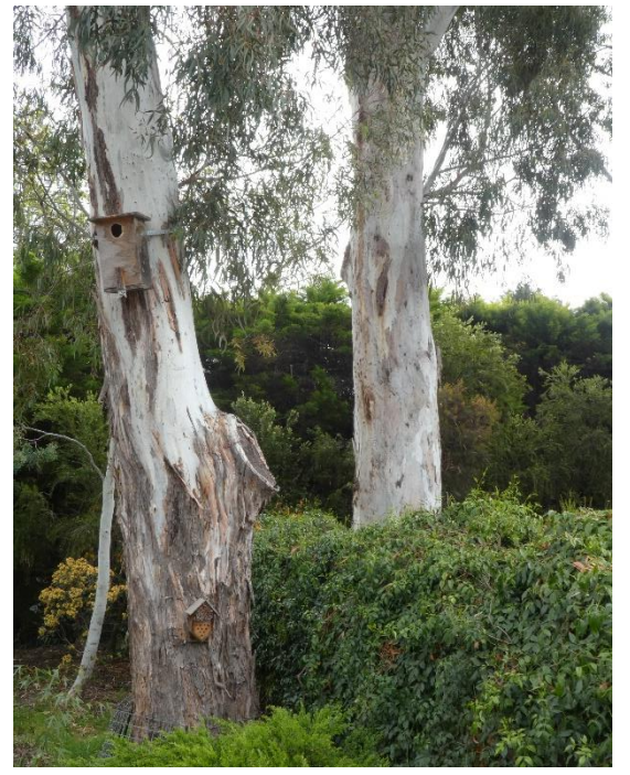
A couple of the original trees of the area, Eucalptus mannifera , were maintained to provide visual balance, and a place for birds to rest securely

Able Landscaping was hired to complete site preparation and initial planting, and the Elvin Brothers, David and Ian, constructed the rockwork around the large and small ponds from rock quarried at Newline near Queanbeyan. All drainspouts from the roof and run off from the extensive granite paving are diverted into the three pond system, where rainwater is mixed with bore water to run the irrigation system. We use drip irrigation occasionally where practical, but mostly a microjet system for the planted areas.